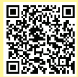
Scan to learn more about our seniors

As freshmen, the Class of 2016 chose “Adopt a Community” as their legacy service project. Forty-one seniors earned President’s Volunteer Service Awards in 2015. Five seniors received a President’s Volunteer Service Award all four years. 25 seniors earned Varsity Letters in community service. Heart Week raised $40,500 for Minnetonka Family Friends, an all-time record.